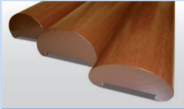
different geometries are possible